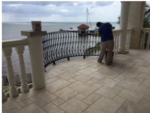
Installation of Wall Finishes and Metal Handrails

3.5 Miles North, San Pedro Town Ambergris Caye, Belize