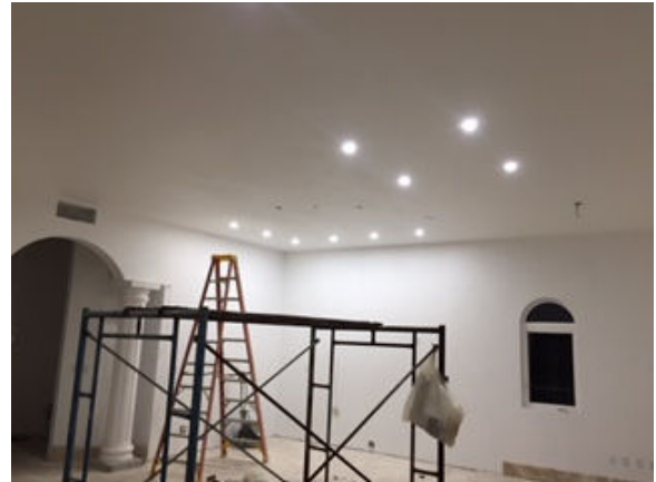
Installation of Electrical Fixtures.