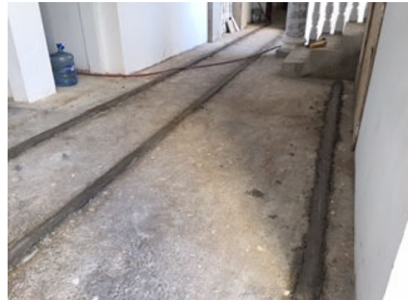
Installation of screed lines and filling up with concrete to allow for Tiling.