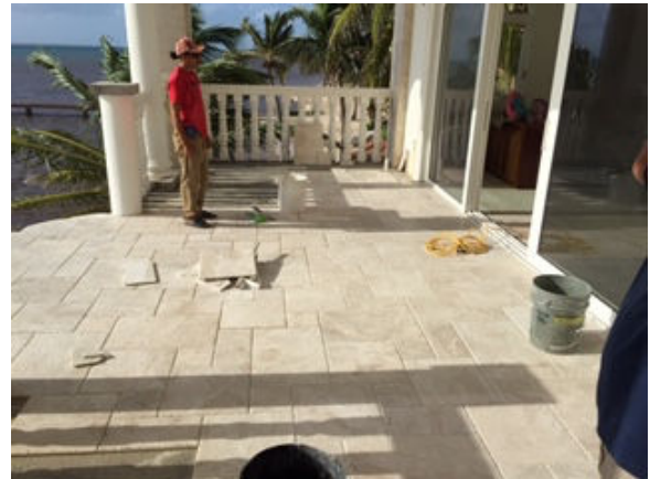
Installation of Floor Tiles and Base Tiles to Balconies.