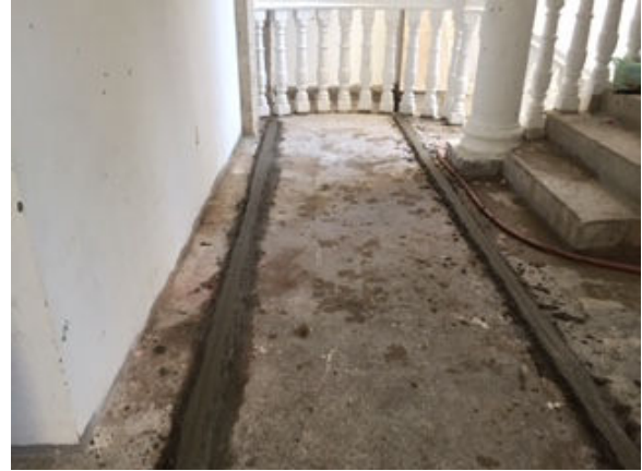
Installation of Screed Lines to Floors - Levels 1 & 2 Balconies.