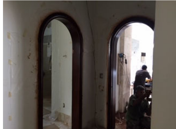
Installation of Wood Doors.