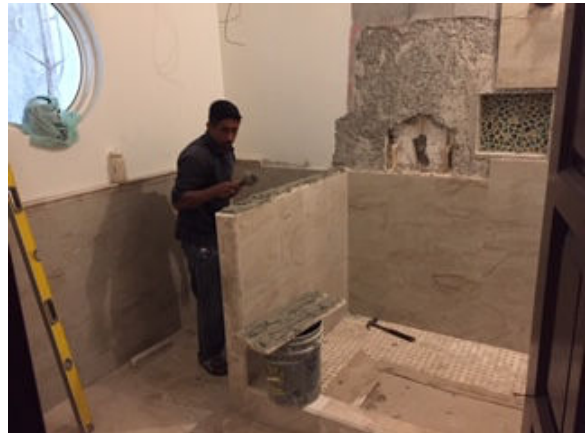
Installation of Floor and Wall Tiles to Bathrooms.