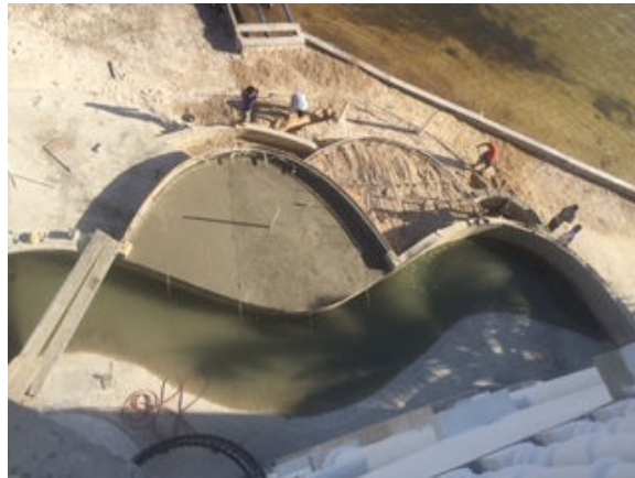
Pouring of Concrete for Swimming Pool Beams, Floor Slab.